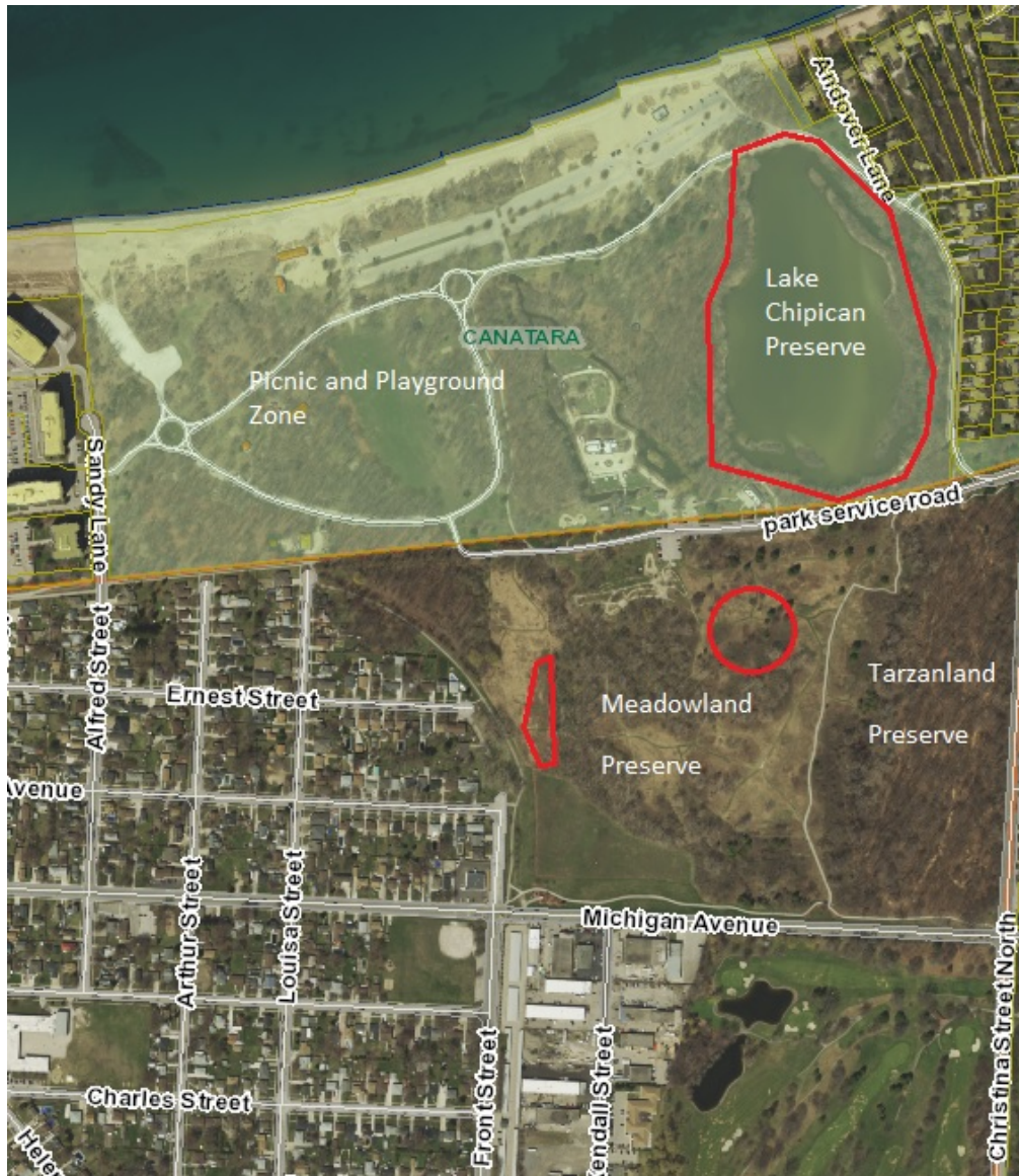
Photo: Map of phragmites spray area in Canatara Park